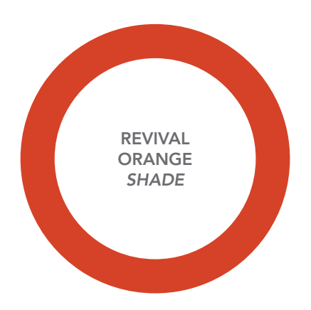
Pantone 7597 C10 M90 Y100 K0 R220 G65 B40 HEX DC4128